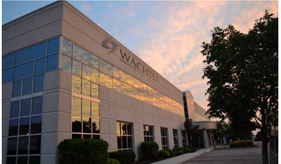
Wachter's company headquarters, located in Lenexa, KS