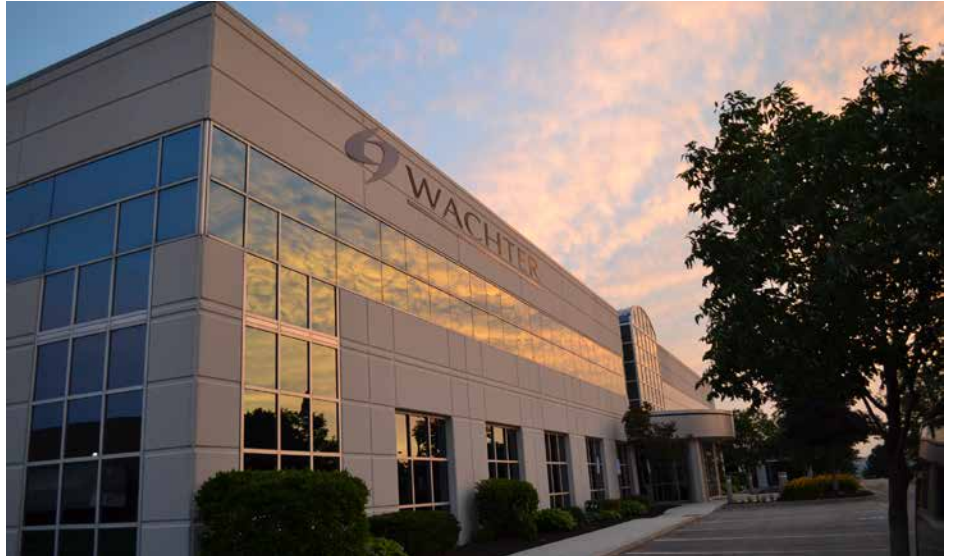
Wachter's corporate headquarters, located in Lenexa, KS